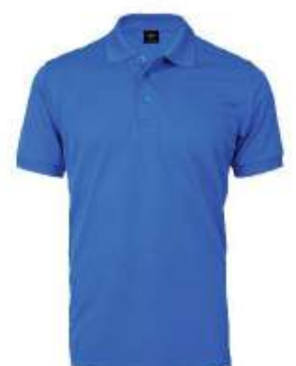
CODE 5000 CODE 5000 WHITE