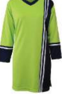
CODE 8082 L. GREEN ( NAVY / WHITE )