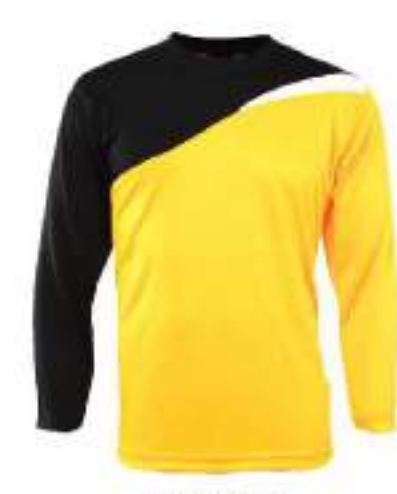
CODE 1804 LS YELLOW (BLACK / WHITE)