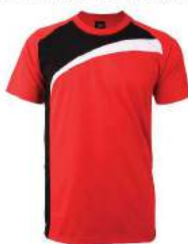
CODE 1828 (BLACK/WHITE)

28/30/32/34/36 (CHILDREN) S/M/L/XL/2XL/3XL/4XL (ADULT)