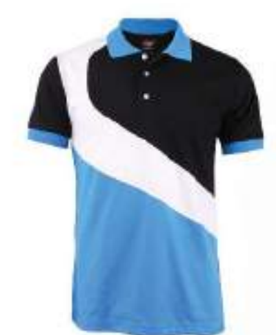
CODE 2781 BLACK (WHITE / DK. TURG)