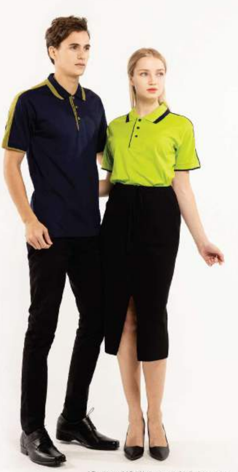
* Due to special finishing process color shades may vary.