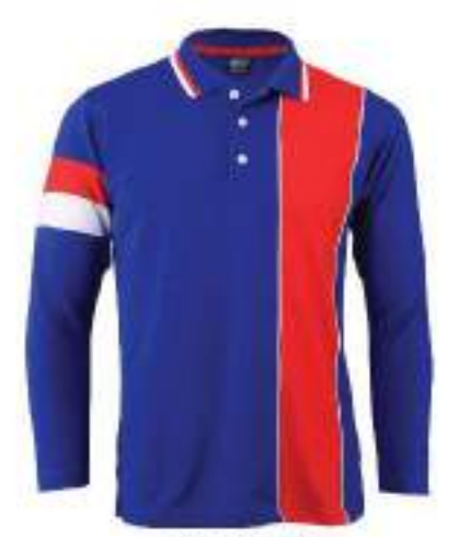
CODE 2678 LS ROYAL BLUE (RED/WHITE)