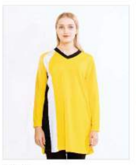
PAGE 76 Code 9073 Microfiber Jarquard 0909