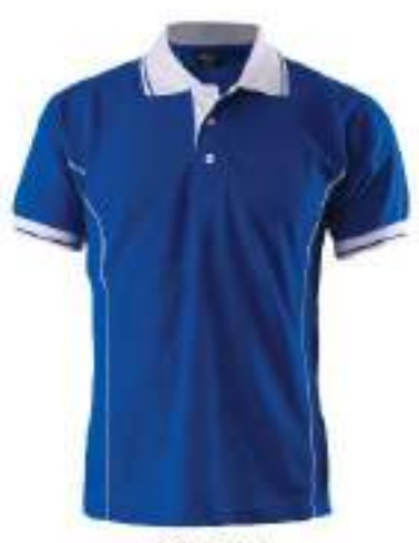
CODE 2141 ROYAL BLUE / WHITE

Polo With Side Panel Piping Fabric: 26 T/C PK