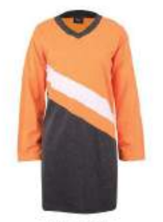
CODE 8094 BABY ORANGE (WHITE / CHARCOAL GREY)