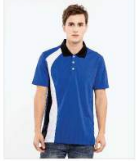
PAGE 69 Code 2773 Microfiber Jarquard 0909