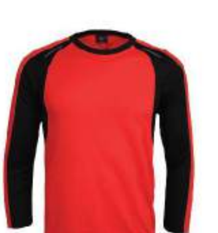
CODE 1806 LS RED / BLACK