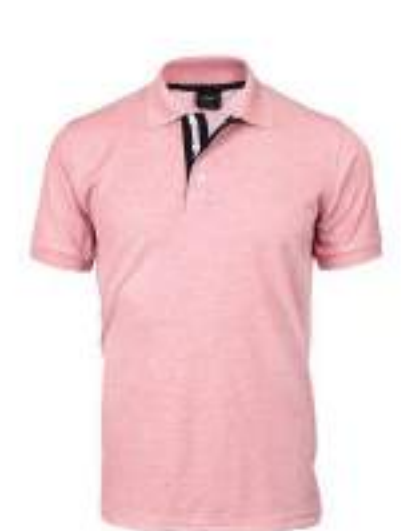
CODE 5101 PINK WARL / NAVY