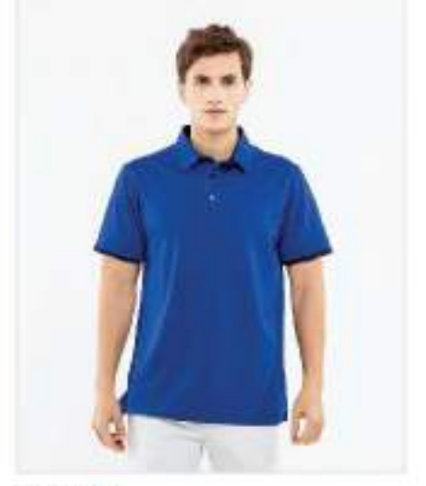
PAGE 47-48 Code 5911 Air' Micro PK