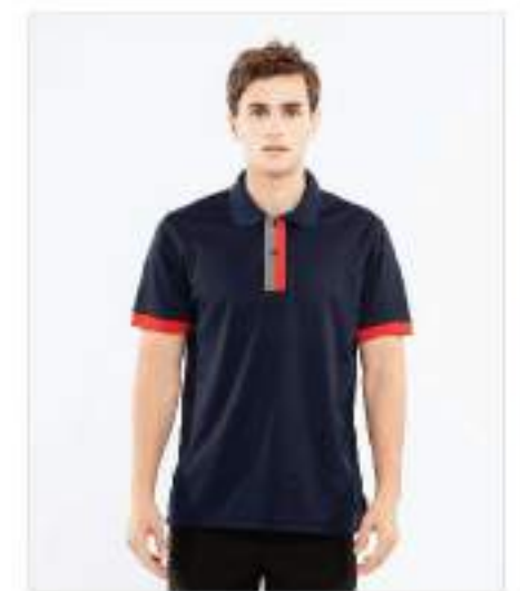
PAGE 58 Code 2638 Micro Cotton