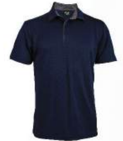
CODE 2920 NAVY