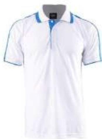
CODE 2573 WHITE / DARK TURQ