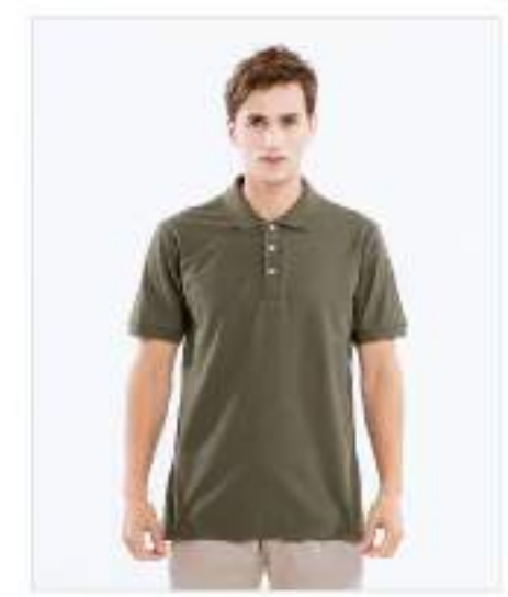
PAGE 25 Code 2160 I/C Lacoste