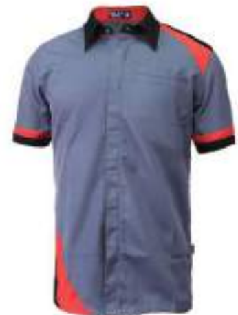
CODEFP05 DARK GREY (RED / BLACK)