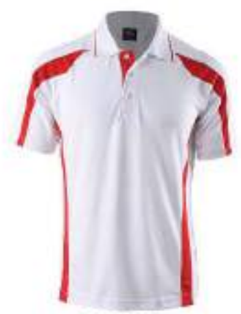
CODE 2069N WHITE / RED