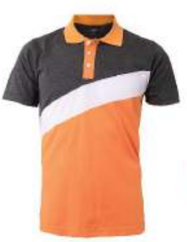
CODE 2794 BABY ORANGE (WHITE/CHARCOAL GREY) (WHITE/NAVY)