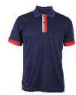
CODE 2638 NAVY ( RED / GREY )