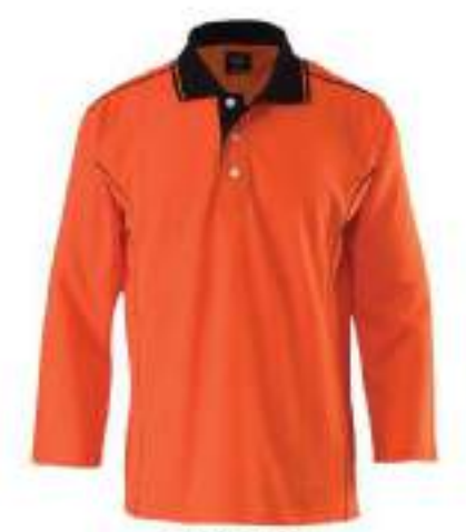
CODE 252115 ORANGE / BLACK