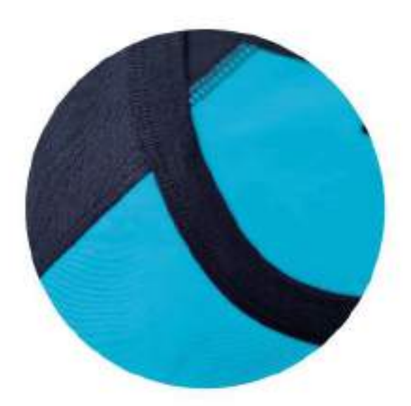
Adult & Child Raglan Round Neck

28/30/32/34/36 (CHILDREN) S/M/L/XL/2XL/3XL/4XL (ADULT)