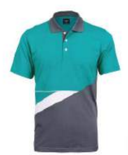
CODE 2993 PETRONAS GREEN (GREY/WHITE)