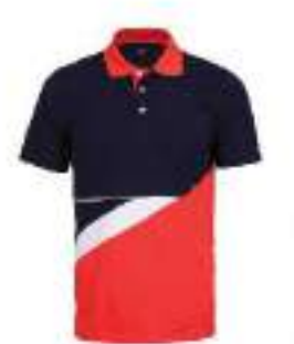
CODE 2893 (RED/WHITE)