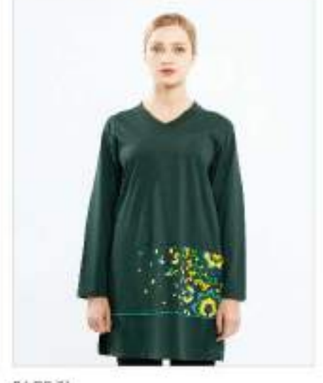
PAGE 71 Code 8096 1/C Single Kinffed