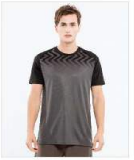
PAGE 64 Code 3014 Microfiber KM286