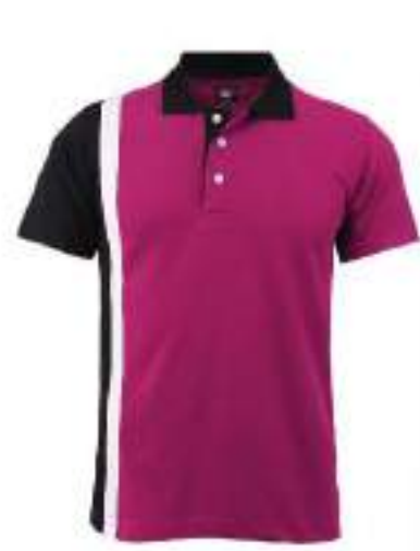
CODE 2020 FUCHSIA (BLACK/WHITE)