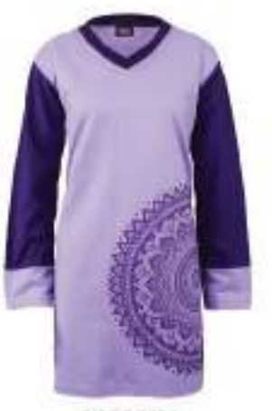
CODE 8088 LILAC / DARK PURPLE