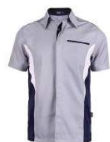
LIGHT GREY ( NAVY / WHITE )