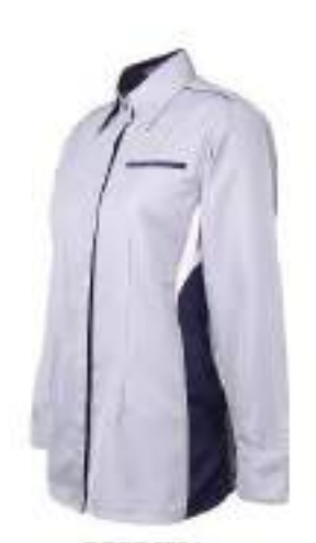
CODE FP04 RED (BLACK/WHITE)