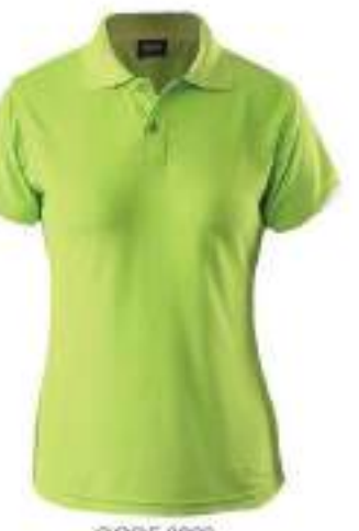
CODE 2283 L. GREEN / WHITE