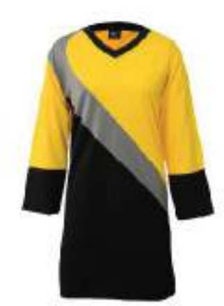
CODE 8081 YELLOW (BLACK / GREY)