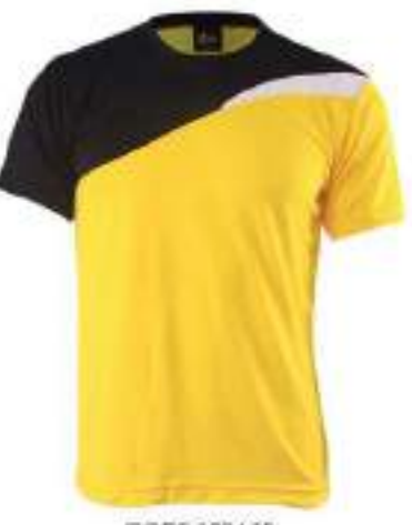
CODE 1804 SS YELLOW (BLACK/WHITE)