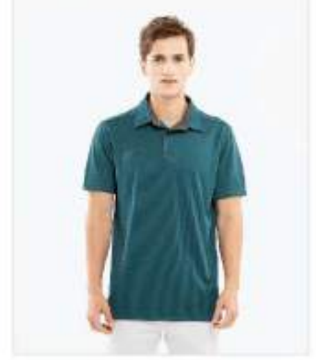
PAGE 57 Code 2920 Shipy Micromesh