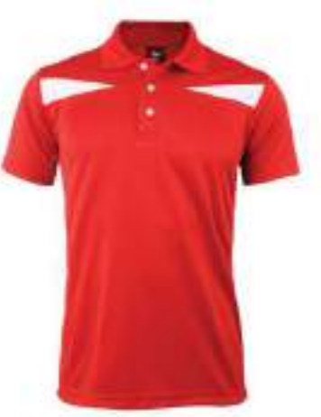
CODE 2883 RED (WHITE/BLACK)

Unbalance Cut Polo Fabric: Microfiber Twill