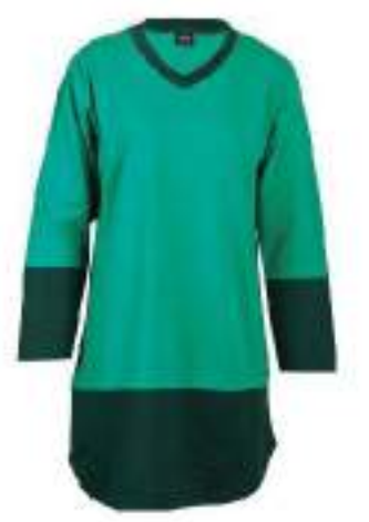
PETRONAS GREEN / DARK GREEN