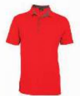
CODE 2920 RED