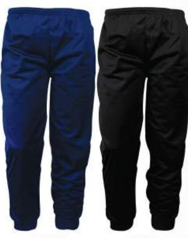
CODE 9500 CODE 9500 NAVY BLACK

26/28/30/32/34/36/38/40/42/44/46 (CHILDREN)