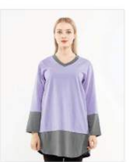
PAGE 72 Code 8097 1/C Single Kinitted