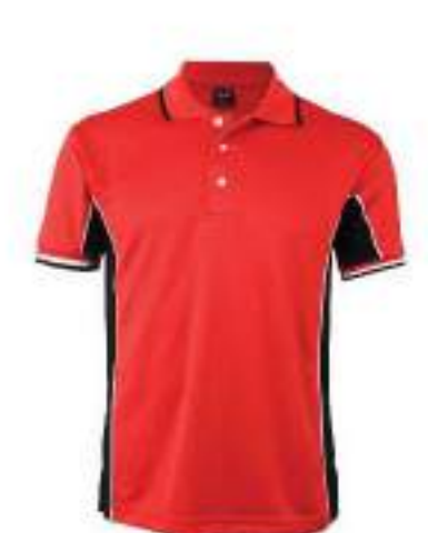
CODE 2784 RED (BLACK / WHITE)