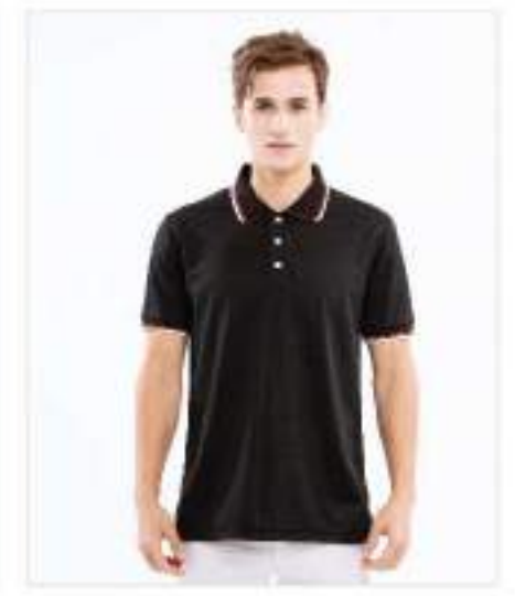
PAGE 44 Code 5001 Air' Micro PK