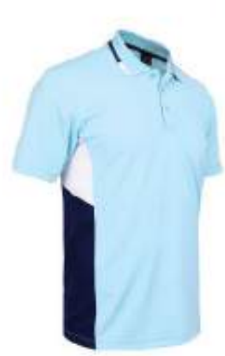
CODE 5011 ICY MINT ( NAVY / WHITE )

Block Side Panel Polo T-Shirt Fabric : Air' Micro PK