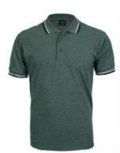
CODE 2016 HEATHER DARK GREEN