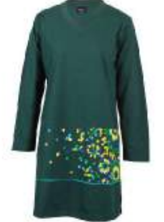
CODE 80% FOREST GREEN (P. GREEN PIPING)