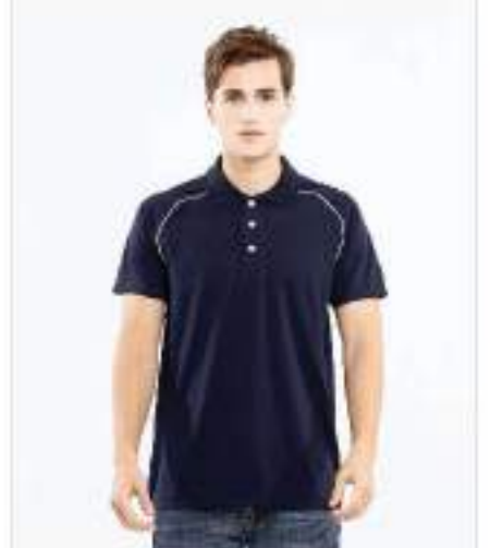
PAGE 16 Code 2668N T/C Single Knilled