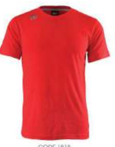
CODE 1818 RED