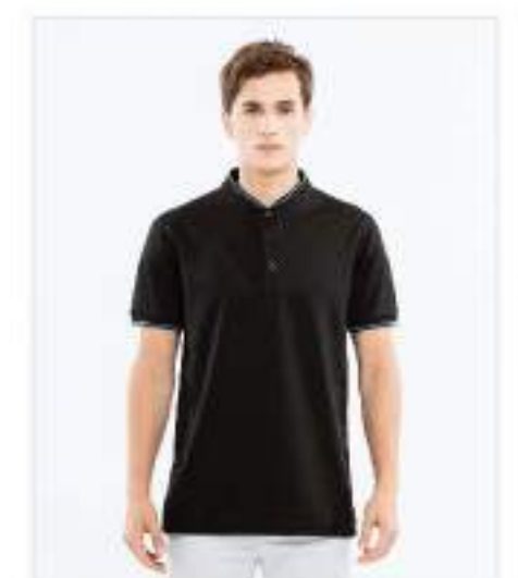
PAGE 43 Code 5802 Air' Micro PK