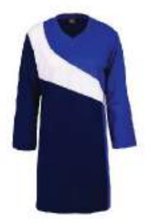
CODE 8089 NAVY (ROYAL BLUE / WHITE )