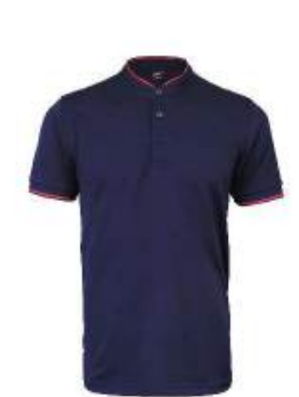
CODE 5802 NAVY (NAVY / RED.)