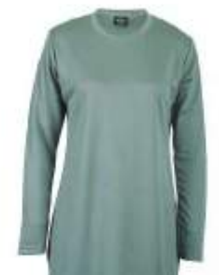
CODE 8850 COOL GREY