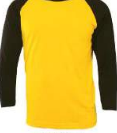
CODE 1028 LS YELLOW / BLACK