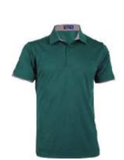
FOREST GREEN / GREY

Smart Casual Collar Shirt Fabric: Air' Micro PK