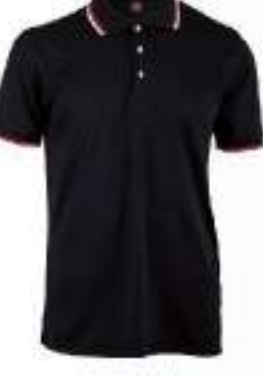
CODE 5001 BLACK (RED / WHITE)