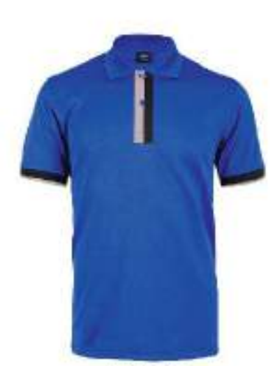
CODE 2638 ROYAL BLUE (BLACK / GREY)

Polo Shirt with Color Block Placket (2 BUTTONS) Fabric: Micro Cotton