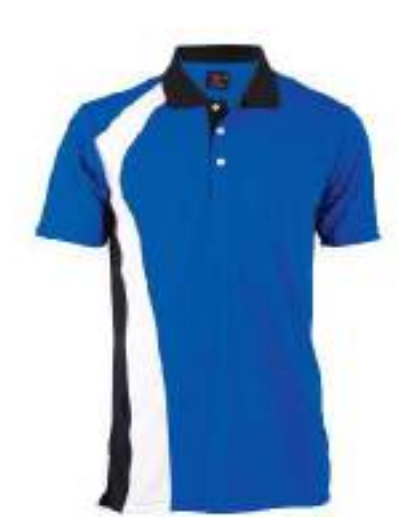
CODE 2773 ROYAL BLUE (BLACK/WHITE)