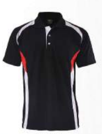
CODE 2816 BLACK (WHITE / RED.)

Cut & Sew Collar Shirt Fabric: 26 T/C Single Knit