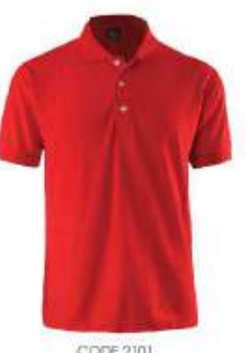
CODE 2101 RED