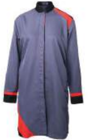
CODE FF08 RED (BLACK / WHITE)