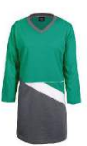
COOE 8093 PETRONAS GREEN (GREY/WHITE)