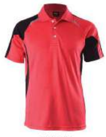
CODE 2724 MAGENTA (BLACK / GREY )