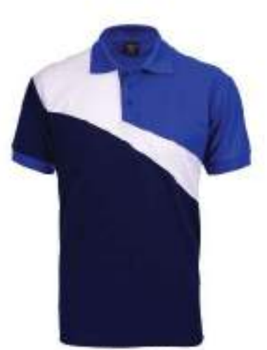
CODE 2789 NAVY ( ROYAL BLUE / WHITE )