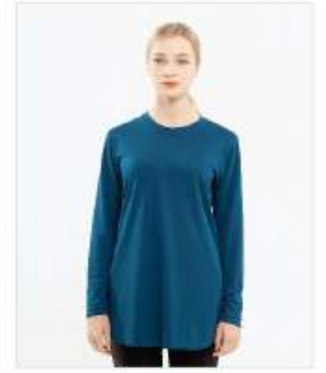
PAGE 53 Code 8850 Micro Mini Rhambus