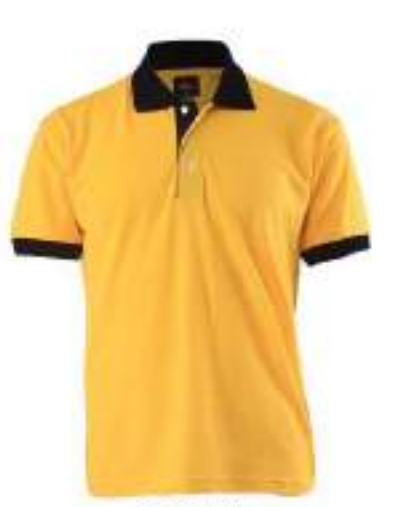
GOLDEN YELLOW / BLACK