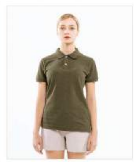
PAGE 26 Code 2183 I/C Lacosle